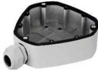
DS-1280ZJ-DM25 Junction Box