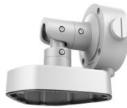
DS-1283ZJ Wall Mount (3-axis Adjustment)