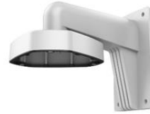
DS-1273ZJ-DM25 Wall Mount