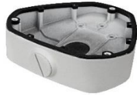
DS-1281ZJ-DM25 Inclined Ceiling Mount